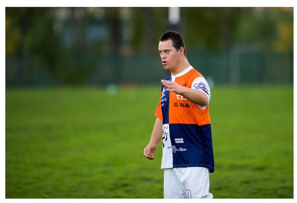
Figure 67. A member of the club in the training sessions.

The development of the inclusive rugby project is financed by sponsors, such as the Sanitas Foundation (an important Spanish healthcare company), the Urbaser and Urvios companies, and the Foundation of the Autonomous University Madrid. The Sanitas Foundation is the club's main sponsor. The club also receives support from local institutions such as the Town Hall of Alcobendas and the Alcobendas Sports Foundation (FUNDAL).