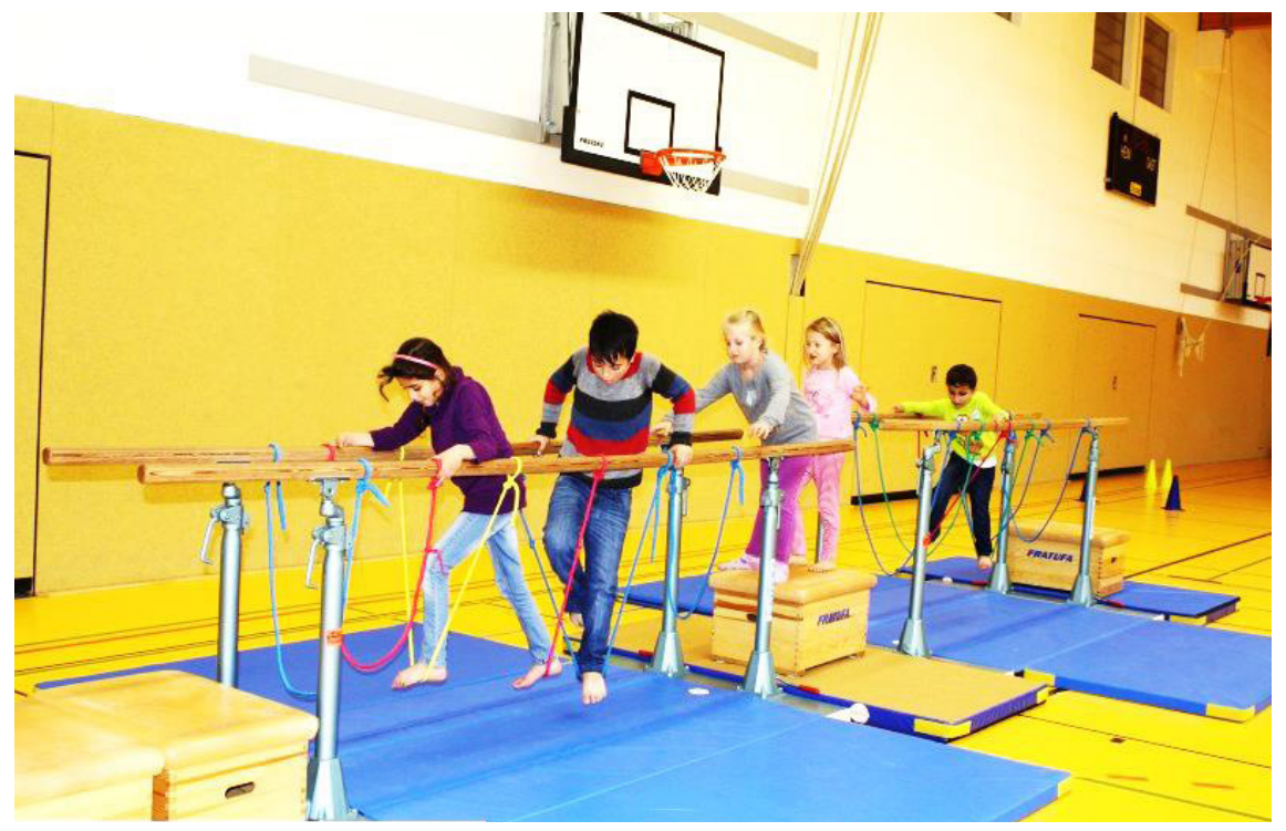
Figure 42. Children at sports practice in the Budokan sports club.

has appointed someone specifically responsible for integration purposes. The club has close to 220 members and employs 30 people. According to Susnik, half of all club members and two thirds of the club's board have a migration background. Besides judo and karate, the club now also offers other fighting sports, like ju-jutsu and capoeira.