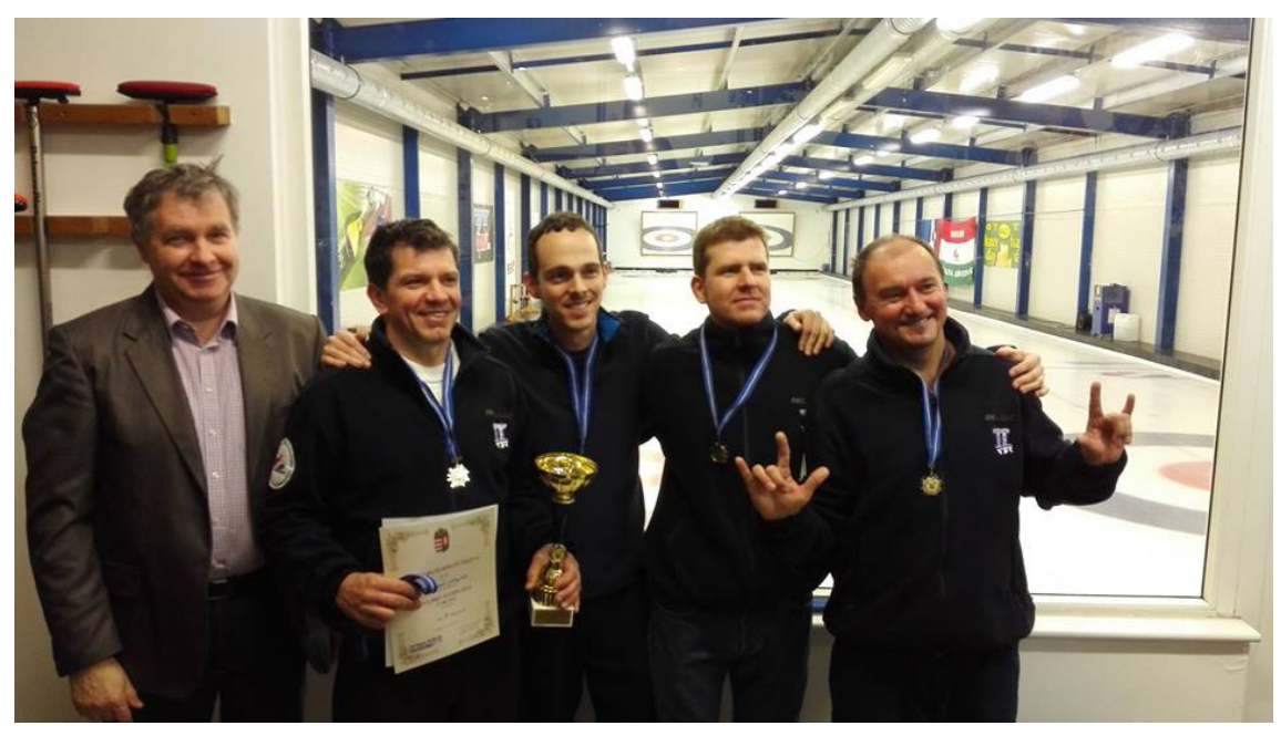
Figure 48 Curling team at the National Cup in 2014.

The club management makes a strong effort for social integration of people with hearing-impairment, and they recruit deaf athletes in different sports disciplines. Their work is mostly on a voluntary basis, where regular income is not received. Coaches are often club members who are also asked to deliver coaching duties voluntarily, and through these opportunities they can be involved in the club's daily life. The club members are given the opportunity to participate in international events, just like their hearing peers. At the national level, deaf athletes are unique in terms of success, and athletes perform well at international competitions in a variety of sports disciplines, including the Deaflympics in particular.