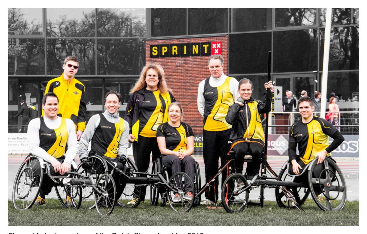
Figure 11. Ambassadors of the Dutch Championships 2016.

A good practice example comes from a sports club from the Netherlands, A.V. Sprint Breda , which is targeted at people with a wide range of disabilities: physical, mental and Alzheimer's disease. In order to create a very inclusive club, sports activities within all disciplines of track and field are available to all athletes with a disability from age seven. All activities are focused on the social integration of people with disabilities. It has become a natural way of encountering each other, there are no barriers on the track or within this club. The board