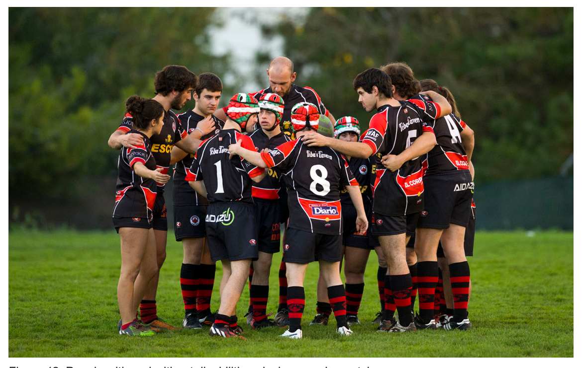
Figure 12. People with and without disabilities playing a rugby match.

Another club which has developed an inclusive project and promotes the integration of people with different types of disabilities is the Alcobendas Rugby Club from Spain. What is interesting is that the idea arose mainly from an association of parents of handicapped children in Alcobendas (APAMA). This is an example of an organisation that implemented a holistic approach and began the project with a process of training the board of governors, the members, the players, the technical team and the delegates of the club in collaboration with professors from the Autonomous University of Madrid about the significance of social integration among vulnerable groups. The club engages coaches and specialised support staff who work with players with cognitive and behavioural disabilities (i.e. autism, attention deficit, hyperactivity). Two support technicians coordinate the needs of the coaches, so that all players can follow the learning and training pace. The main advance achieved until now is the integration of the school's players into the regional rugby leagues in the Community of Madrid, which is an important achievement in terms of normalising disability.