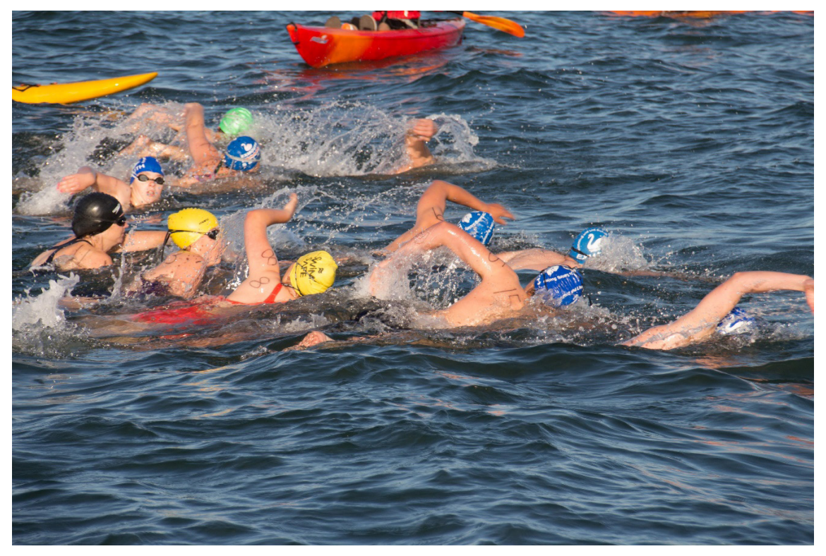
Figure 41. The start of the Starcross to Exmouth open water swim in 2015.

pool to provide swimming lessons to 180 children every Saturday night, and to run a competitive & development section on Friday nights for approximately 100 swimmers. It is unusual in the United Kingdom for a swimming club to be the main provider of swimming lessons, as most swimming pool operators will do this exclusively themselves. ESLS negotiated this agreement when the club relocated to the Leisure Centre from the lido. ESLS is therefore able to cater seamlessly for the entire aquatic pathway and is able to generate income from their own Learn to Swim programme. ESLS also runs masters and open water sections, and is responsible for administering the East Devon Mini League, in which six swimming clubs from the district compete. ESLS is managed entirely by volunteers and only employs one individual, who is the head coach of the club's Learn to Swim programme.