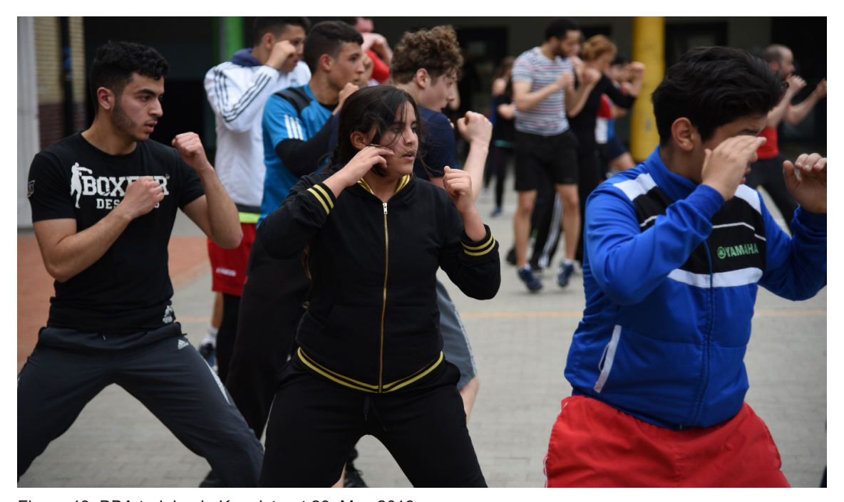
Figure 18. BBA training in Kogelstraat 29, May 2016.

Another good example in this category is the Brussels Boxing Academy (BBA) from Belgium, which manages to reach a diverse range of members from different social layers, mainly young members with a migration background and refugees. Its mission is to develop a quality boxing operation with a strong base programme which anyone can join, at any time of the year, at a reasonable price. The dual role of the trainers educating the youth both physically and socially must be emphasised as their role is not limited to the sporting framework. Personal problems, problems at school, in the neighbourhood or family problems can be addressed. The BBA is working on the emancipation of young people in Brussels, both through sport and through extra-sporting group projects, individual counselling and guidance. BBA reaches out to the environment, wants to bring boxing to youngsters and gives initiations on the street, in schools, at festivals or neighbourhood parties. Moreover, BBA takes part in cultural, sporting and social projects that expand the world of young people and provides empowerment to be stronger as a person in society.