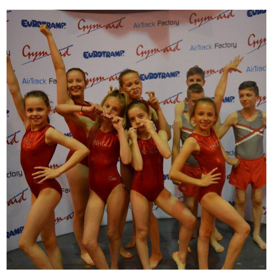
Figure 20. Northern Hope Gymnastics Centre.

The Zwaluwen Utrecht 1911 club from the Netherlands was selected as a European good practice club because it successfully attracts people from different neighbourhoods with different socio-economic and ethnic backgrounds. The most distinctive element in this club is that it introduces new sports that are explicitly linked with other groups in society than the members that the club originally attracted. The club's policy is aimed at having an ethnic mix in every team. "Most clubs are oriented at 'our kind of people', but we are not. Rather, we want variation, because we think that when you meet at a young age and you play sports together, you will benefit from that later on. In our club, sport is part of one's education. If things are going well for you at the club, the chance that things are going well at home is also greater", notes former chairman Cor Jansen. Apart from the integrative perspective towards ethnic minorities, the club also has an eye for socially vulnerable people. The club states that its fields and its facilities should be open to people from the direct environment to participate in social activities. One of the practices that could be considered as an example of this 'openness' is the possibility for residents of the neighbourhood to play card games at the club house. Socially vulnerable people can participate in volunteer roles, for example in maintaining the facilities of the club.