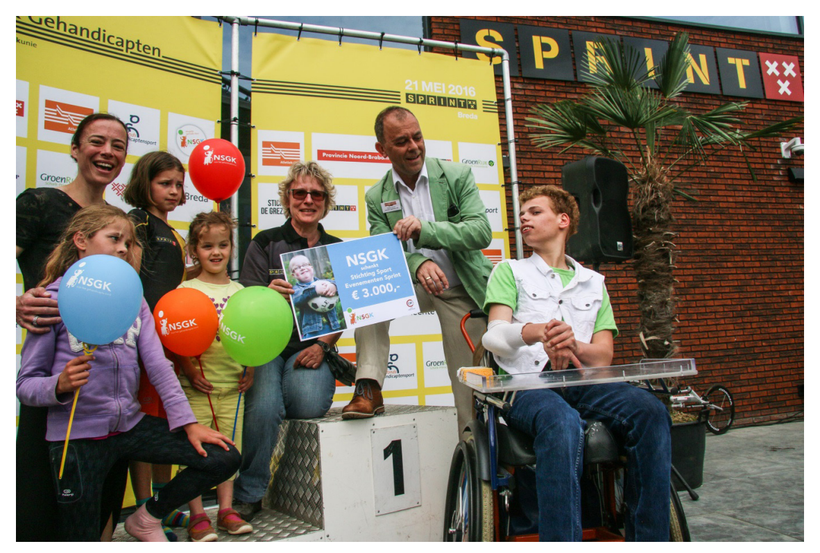
Figure 50. Sprint receives \in 3,000 from the Dutch Foundation for the Disabled Child.

in the Championships on May 21st. There are no structural fees for Sprint besides the regular fees for youth (with and without disabilities).