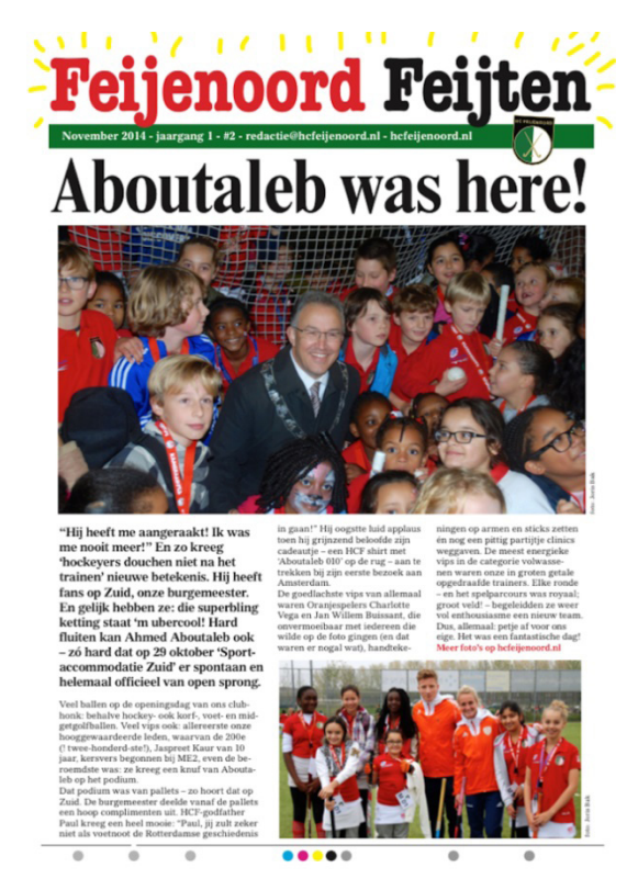
Figure 52. Mayor of Rotterdam Ahmed Aboutaleb visited HC Feijenoord in 2014.

People from the HCF board visit network meetings, congresses, sport events and HCF participates in a number of surveys. And of course, with the free hockey training sessions at four different locations