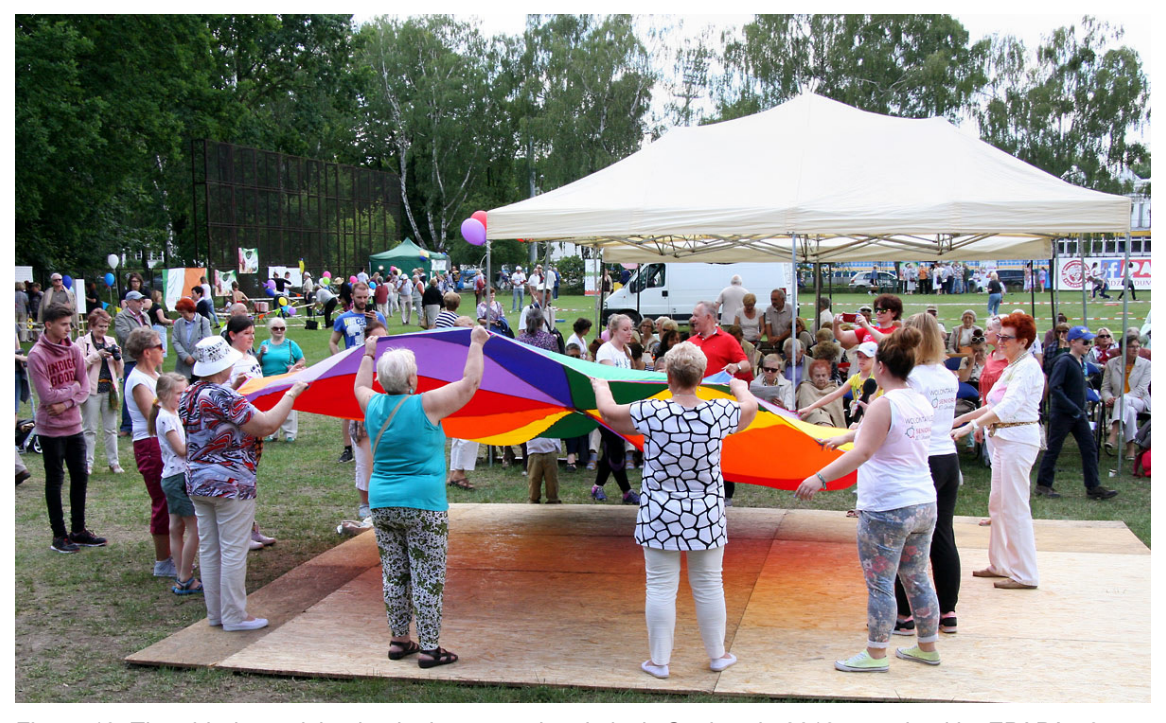
Figure 10. The elderly participating in the recreational picnic Seniorada 2016 organised by EPAPA 50+.

At the end of the programme, a meeting is organised in each community with representatives of self-government units, non-governmental organisations, and citizens in order to exchange information and experiences in the field of activity and the social integration of elderly people.