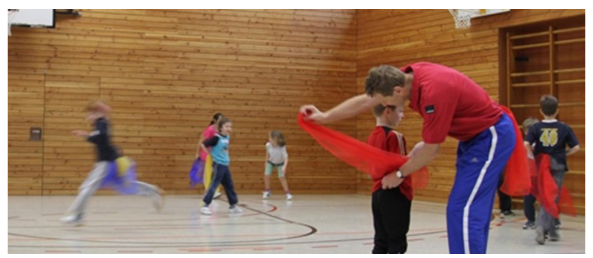
Figure 5. Sports activities for children at the ISB.

The German club named Idealverein für Sportkommunikation und Bildung e.V. (ISB) is a young and modern sports club which manages the "Bewegte Ganztagsschule" ("moving all-day school") project that fosters social integration. As an external partner, the ISB has been managing the afternoon programme of four all-day schools in and around Schweinfurt since 2008. About 300 boys and girls are offered activities like for example swimming, volleyball or hip hop dancing classes, but the "Bewegte Ganztagsschule" is more than a line-up of different sports activities. The programme includes not only sports, but also education on topics such as nutrition and the catering during lunch time, as well as homework supervision. The idea is to support and foster social learning, thereby helping children to develop into confident individuals. Through the expansion of the all-day school model, children and adolescents who take part for at least one school year more frequently sign up as members of sports clubs than children who do not participate in the project.