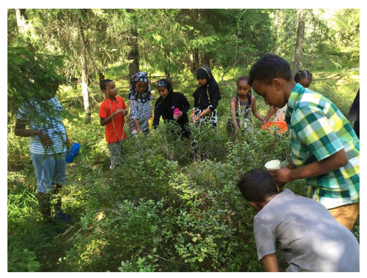
Figure 4. Hiking in the woods.

Another good practice example is the young club Tøyen (est. 2015) which uses a very wide spectrum of activities (from traditional sports activities like ball games, cricket, yoga and swimming, to Zumba, flamenco and more recreational forms like knitting) to foster social integration and enthusiasm in the local community, but also to strengthen the local affection and pride for the club. Whereas sports clubs traditionally have different groups (ski, football, etc.), Tøyen is very clear about supporting activities that are more ad hoc. For example, when someone takes the initiative to participate in knitting as an activity, this activity depends neither on there already being a more formalised knitting group in the club, nor on there being a demand to establish a more formalised structure for doing knitting in the future. The club also has a strong relationship with the municipality and the local city district, and it also engages in local events like festivals and Christmas markets. Being spontaneous, Tøyen utilises existing engagement in the local community to generate activity and solidarity.