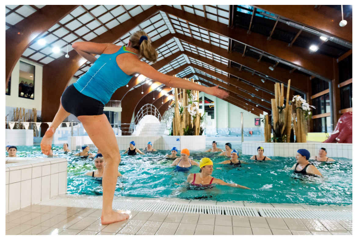
Figure 58. Physical activity leader during class.

• Seniorada – i.e. recreational events of intergenerational solidarity all over Poland. Each year's edition of Seniorada attracts several hundred seniors in 6 communes in Poland. During recreational picnics, a recreational rivalry takes place over prizes (recreational combined events), as well as the competition for the most active person title. Since 2011, Seniorada has been a nationwide picnic. The project is co-financed by the Ministry of Sport and Tourism, as well as funds coming from the local government entities and partners: media and business. The project also has a cooperation with Higher Education Schools: Opole University of Technology, University of Rzeszów, and Józef Piłsudski University of Physical Education in Warsaw. Within the scope of cooperation with higher education schools, we invite and include students to be active in the organisation of the project as volunteers. In each project location, there is a local project coordinator assigned by EPAPA 50+, who supervises the work of student organisers for seniors: Students for Seniors - Young for Older. Each student in the team concludes a voluntary service agreement. People who are uniquely engaged, reliable and creative receive a recommendation issued by EPAPA 50+.