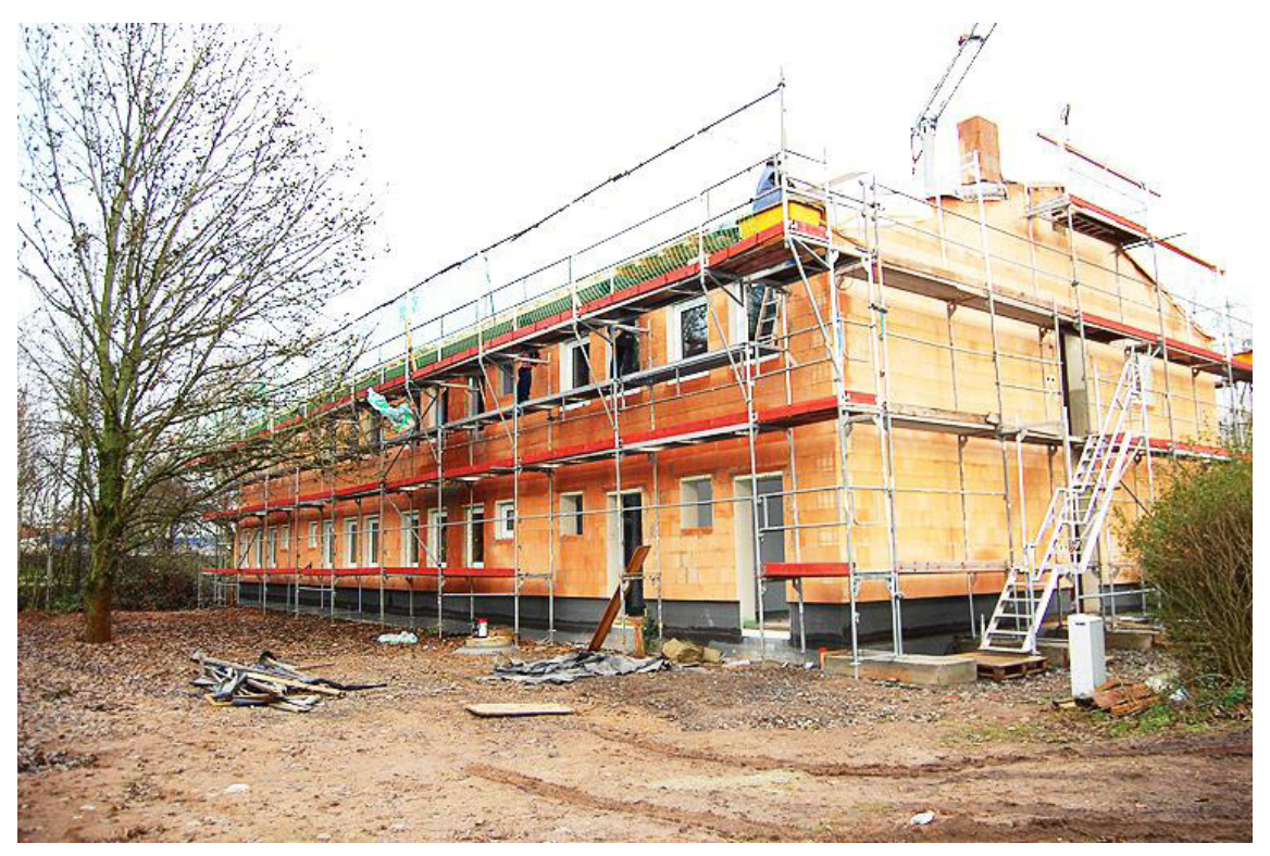
Figure 3. Construction of a refugee home, later used as a clubhouse and boarding school.

Another club engaged and committed to promoting the social integration of refugees is the Budokan Maintal e.V. sports club from Germany. One unique example of good practice has been to construct temporary refugee accommodation, which will be used as a club house and a judo boarding school in the future. The city of Maintal will rent the building with 68 places for a minimum of six years, with an option to extend the contract thereafter for two years.