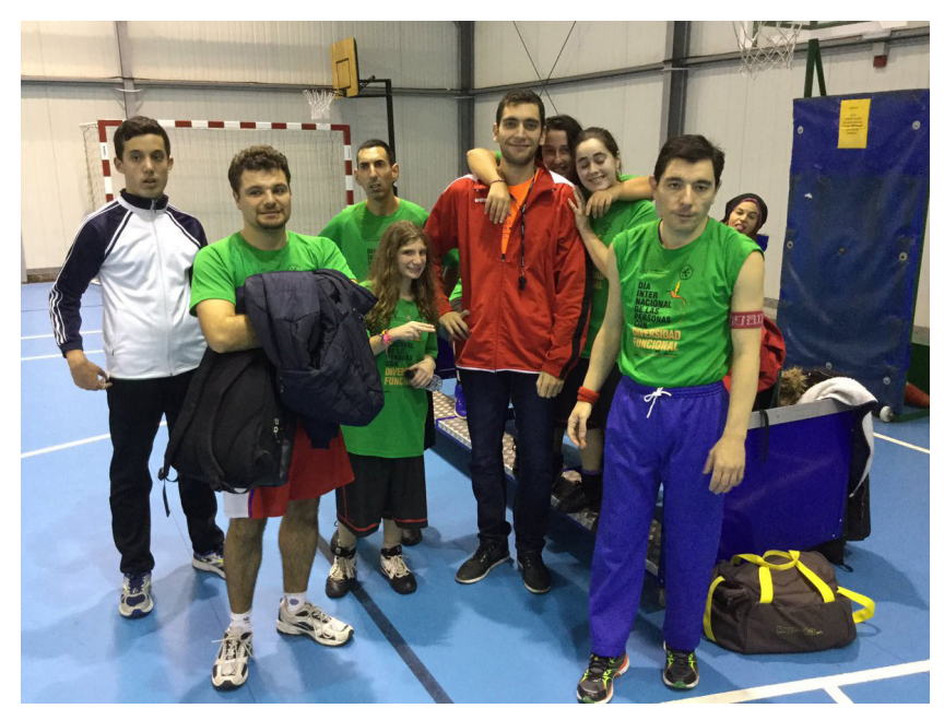
Figure 65. Members and players of the "basketball for everyone" programme.

Furthermore, the club has an intervention programme for families, with which it provides help and guidance for parents about how to help their children and balance sport with studies, how to organise their time, how to behave at a game, what attitude to have towards teammates and rivals, etc. In addition, the club offers the parents the possibility of doing gym and running activities themselves, when they have to wait in the facilities while their children train. The club also has a study hall where the children can study or do their homework if they are waiting for someone to pick them up.