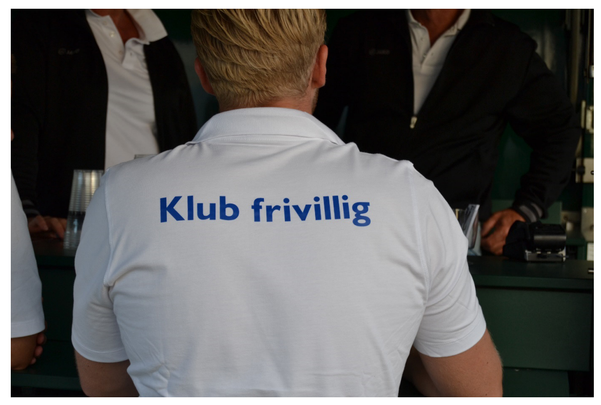
Figure 23. The "club for volunteers" at Skjold Skævinge Sport Club.

A good example of a club that has worked actively with its policy and initiatives towards volunteers is a Danish club, Skjold Skævinge Sports Club (ISS). ISS was founded in 1910 and has become known for developing and introducing the concept of a "club for volunteers" (in Danish "Klub Frivillig"), which has increased the number of volunteers in the club from 14 to 225 within three years. "Klub Frivillig" announced by one of the Danish sports organisations, DGI, in 2012-2013 was an initiative the club initiated during their participation in the so-called "Danish Championship for Club Development". It motivated clubs to develop their club and state explicit goals and dream scenarios for future development. In this programme, ISS identified recruitment and retainment of volunteers as the main area and announced a framework that made it possible for members and other people in the local community to contribute with the type of voluntary work they prefer, as often as they prefer to do so. ISS has developed an internet based sign-up procedure and developed its database called ("Nem-Vagt"), which also allows volunteers to sign up for specific tasks for predefined timeframes. Since the introduction of the club for volunteers in 2013, many Danish sports clubs have been inspired by this concept and introduced their own clubs for volunteers. In 2015, ISS won the "Sports Award" given by the Ministry for Culture, which included a cash price of approximately 13,000 euros.