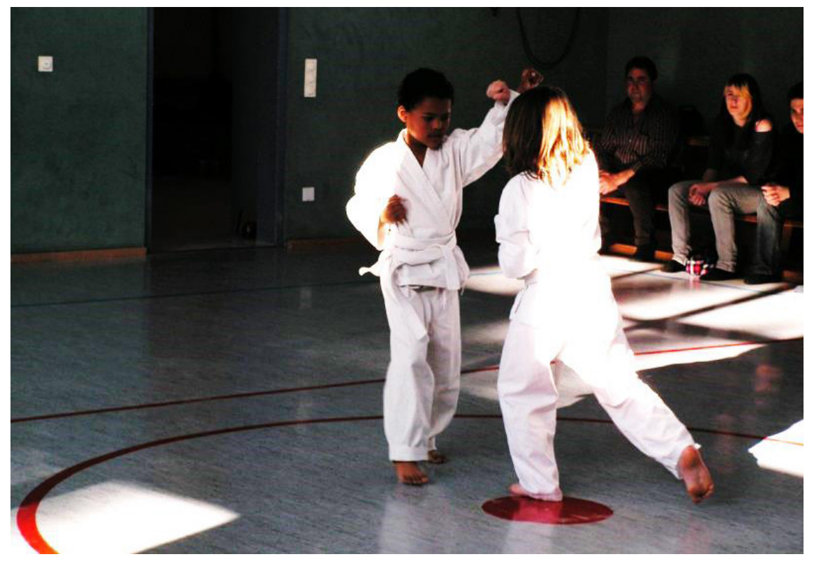
Figure 43. Children at fighting practice in the Budokan Maintal Sports Club.

The city of Maintal has been a key partner in the realisation of the project. The close collaboration of the Budokan Maintal Sports Club and the city council resulted in the general support of the community. The Budokan Maintal Sports Club also invited its members to an information session, in which members were given details about the project plans and were asked to vote in favour of or against the project.