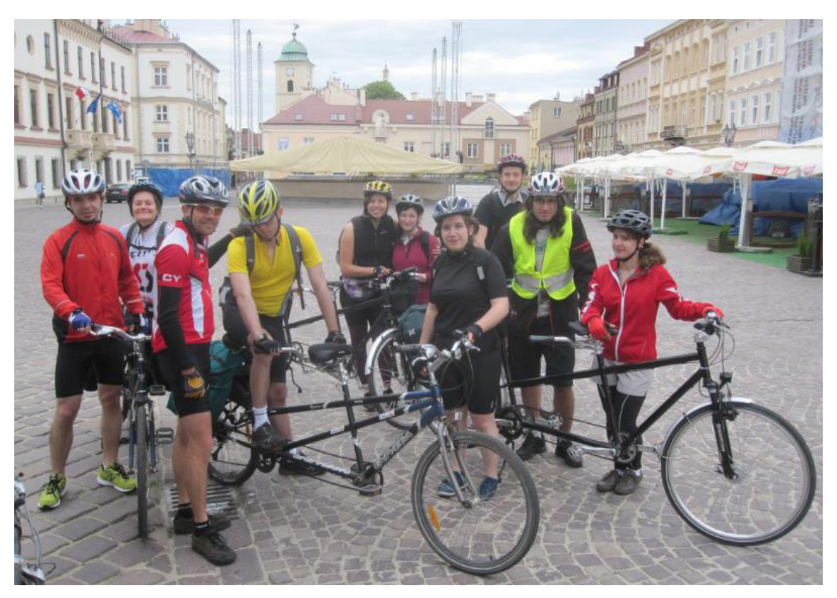
Figure 14. Tandem trip of deaf-blind persons within the programme "I cycle, not seeing any obstacles".

their disabilities. So far, the impaired persons, supported by the association, managed to travel all around Poland, and to go from Warsaw to Tallinn and from Lisbon to Santiago de Compostela. The organisation has its own tandem bikes and experienced guides, who are trained and certified by the association. It runs educational workshops for children and youth, called "Age does not count – you can also be active" aimed at familiarising children with the voluntary service and work with disabled people. School children get acquainted with the basics of alternative ways of communication (sign language and Lorm's alphabet) and the way of guiding blind persons. Moreover, the organisation helps people who have a regular contact with deaf persons to acquire grants from public funds for a sign language course.