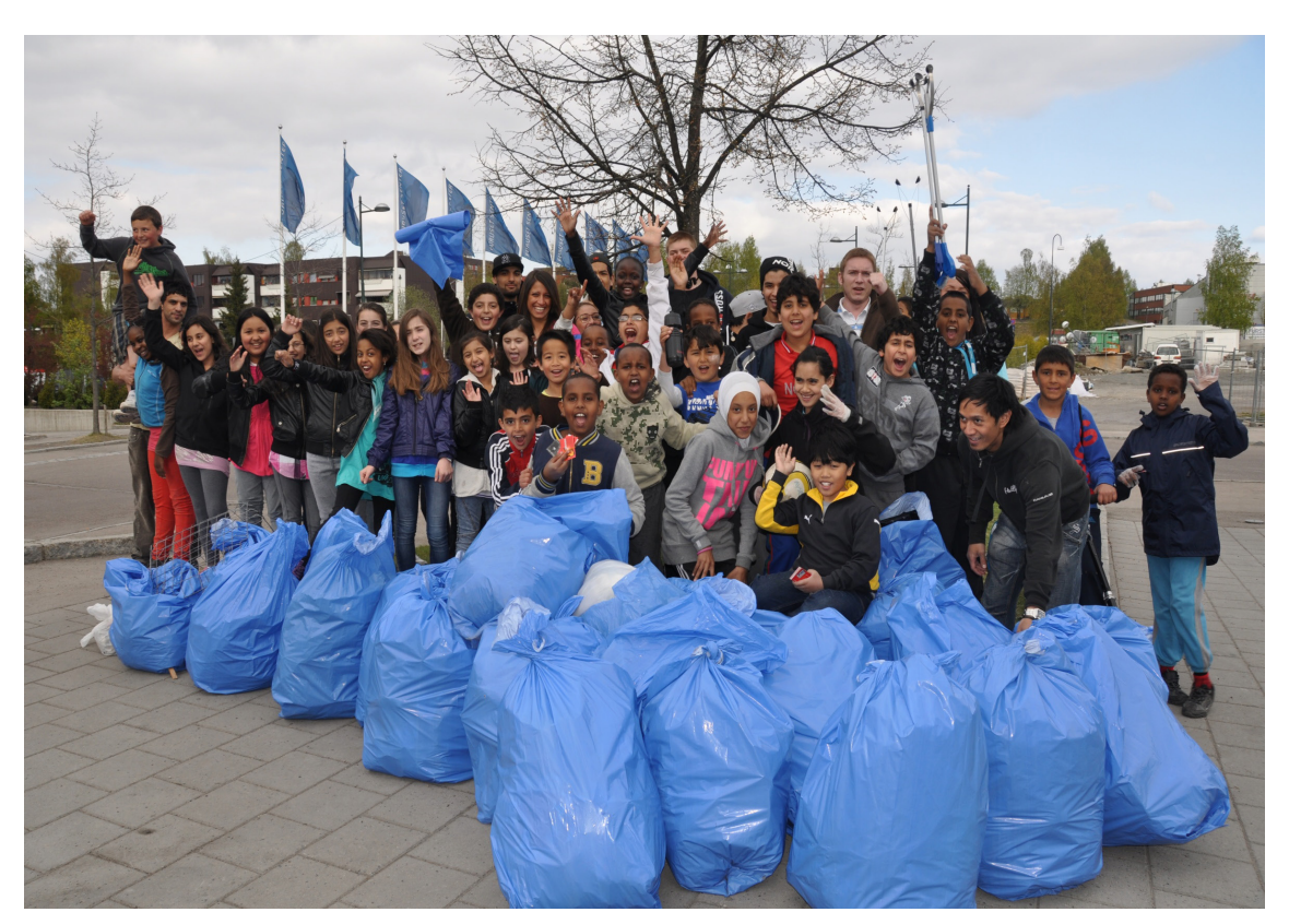
Figure 54. Alnaskolen

The school organises and participates in hundreds of hours of volunteering (dugnad) in the local community during the year.