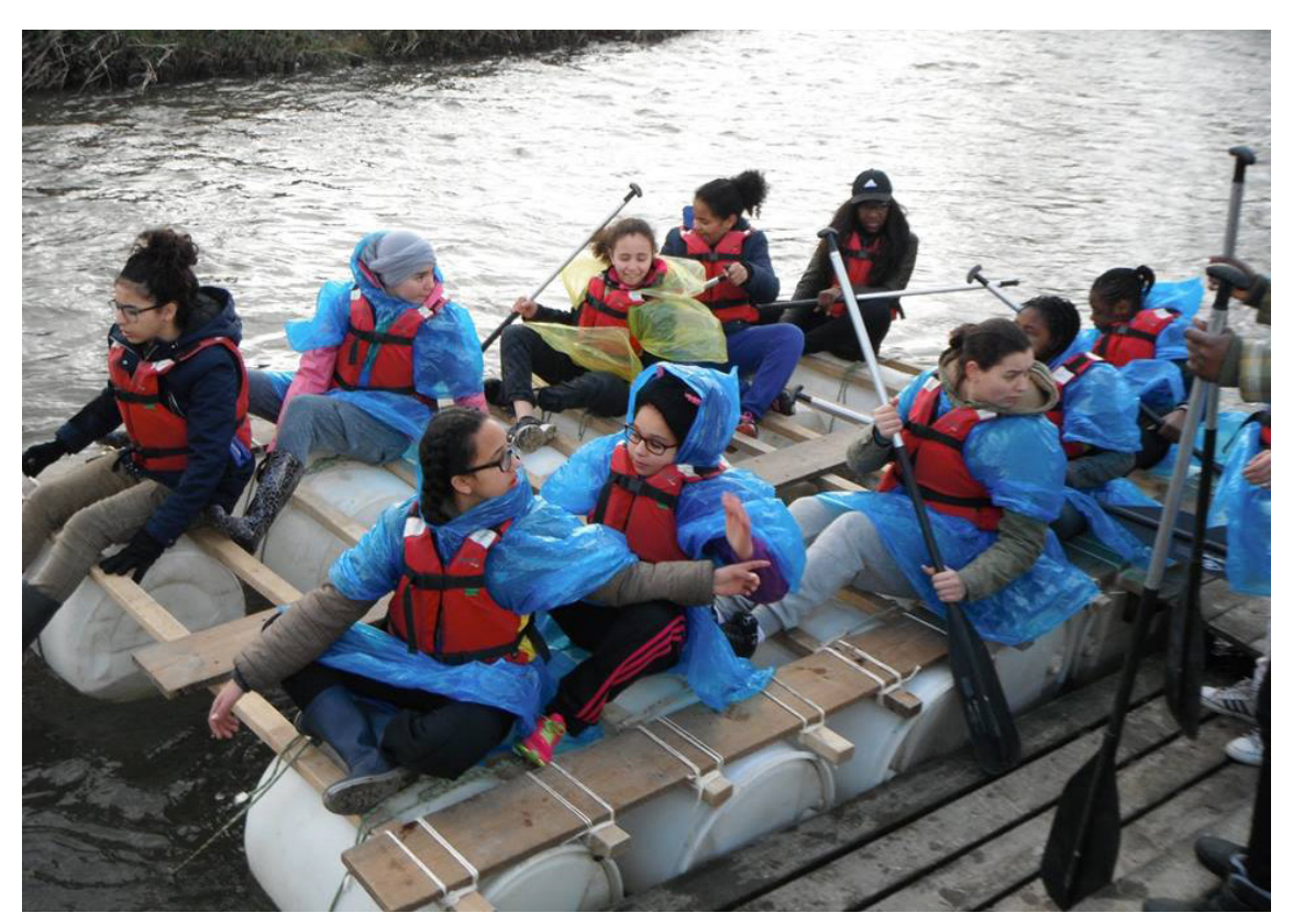
Figure 16. Adventure and teambuilding camp.

club organised an adventure camp with challenging activities. Particular attention was paid to cooperation between the youth, team spirit, self-reliance and social skills.