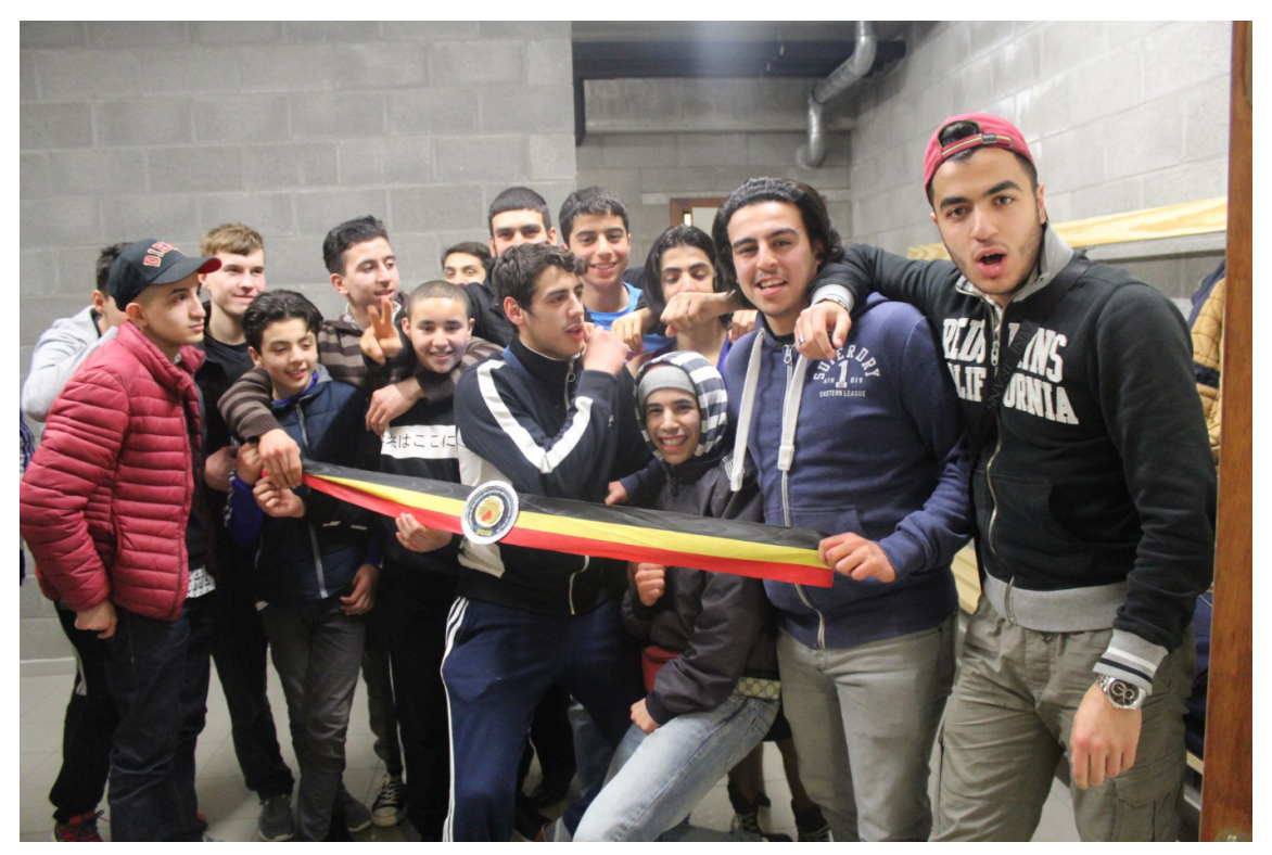
Figure 37. Belgian Championship 2015 in Herstal.

The club mainly reaches young people with an immigration background, refugees and also students. Because of the central location in Brussels, the club also attracts people with a higher socioeconomic status who work in Brussels. Through the 'Sports after School' card, a system through which Flemish high school students can participate in various sports activities after school hours, the club reaches Flemish students as well.