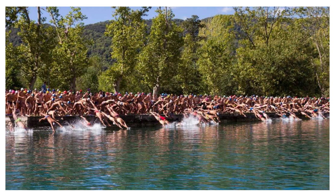
Figure 34. Swimming across Lake Banyoles.

dren practice sport in the club today. Thus, a call for help is sent out to all the people who are or have been linked to the club at any periods and in any capacities. They use different ways to contact people but mostly WOM (word of mouth communication) as Banyoles is a small city with less than 20,000 inhabitants and the club focuses on personal contacts.