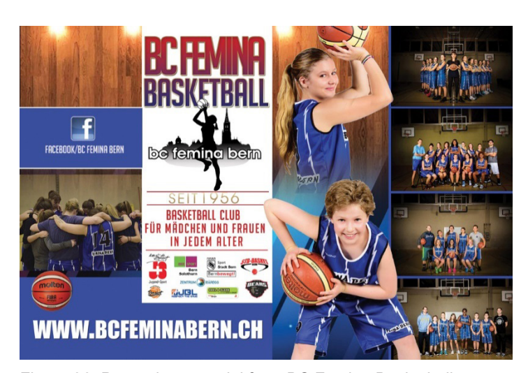
Figure 36. Promotion material from BC Femina Basketball.

Immigrant volunteers even work as coaches or on the board, as young women may get qualifications. The board is also open for migrant women. It is, in fact, made up of immigrants by more than half (first to third generation). Next to eleven volunteers, there are two paid employees (one with a migration background). Responsible persons in the club are sensitised to the cultural diversity in the club. Engaged board members with passion for basketball are highly motivated to reach short-, middle- and long-term aims and energetic. Since cooperation with other organisations is considered a very important goal, the board decision-makers invest a lot of free time in club engagement, not least because of the need of regular exchange and partnerships with the "right" institutions (e.g. schools, sponsors).