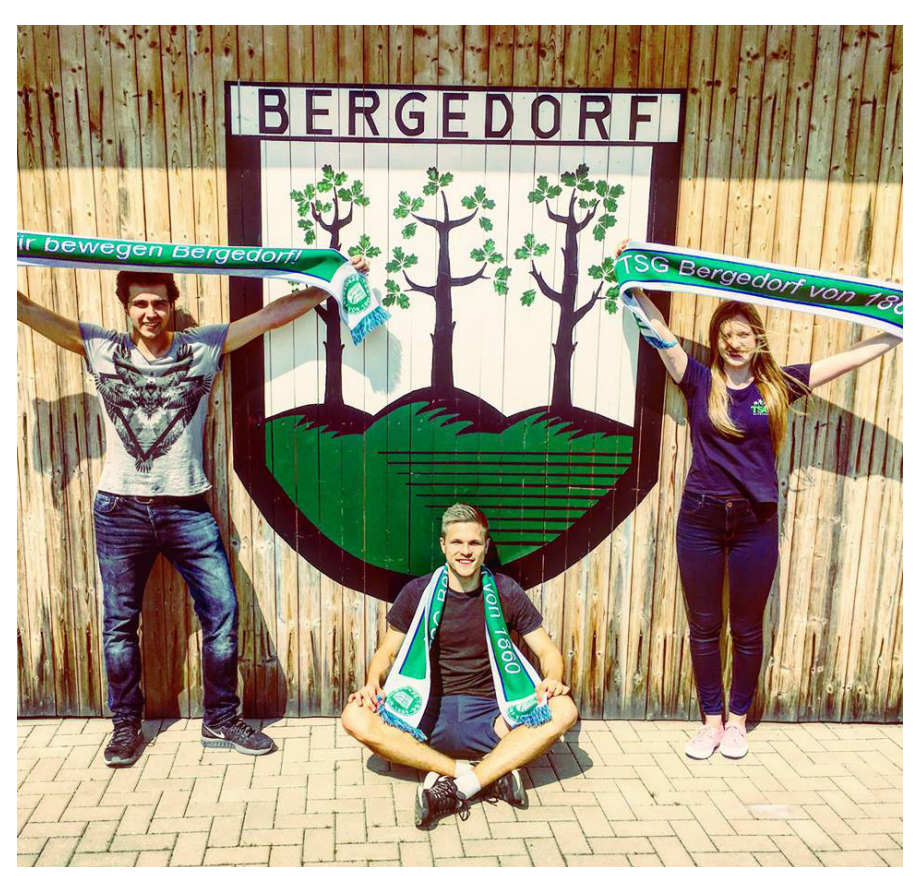
Figure 27. Young members in front of the logo of the TSG Bergedorf in Germany.

The TSG Bergedorf club from Germany, for example, organises social gatherings, such as an annual ceremony in which volunteers are honoured for their outstanding engagement. Also, the volunteers' partners are thanked for their support. Another form of acknowledging volunteer work is to send them birthday cards or to allow them to participate in special sports events or activities. It is very important for volunteers to step out of anonymity, as their work cannot be regarded as a matter of course.