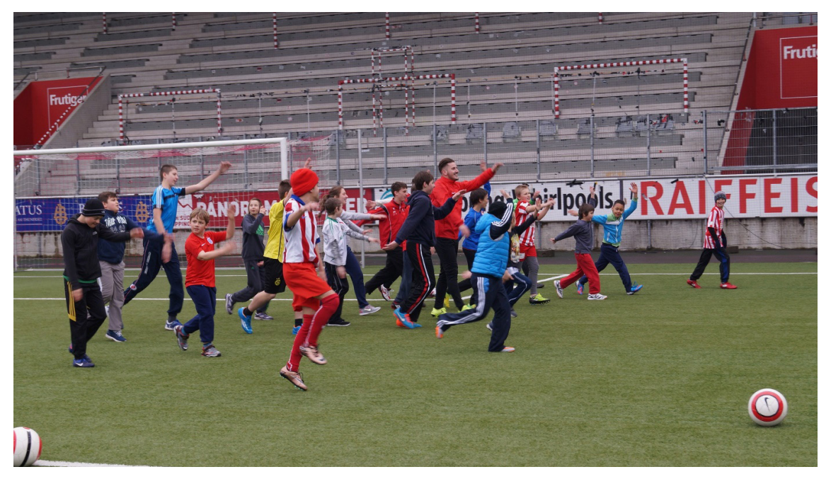
Figure 35. Training for children with disabilities voluntarily supported by players of the professional club FC Thun, Switzerland

good social causes in the context of their club. Such engagement is rarely found in practice in case of a professional football club but could be attractive for other clubs in terms of corporate social responsibility – as in this programme, the focus is on social integration , not for the benefit for the club with regard to talent-sighting. As part of the programme, coaches run special training sessions voluntarily, and they are being supported by professional and talented young players attending the special training in an honorary capacity. It is noteworthy that, in 2015, the players and coaches of FC Thun worked 10,000 volunteer hours for the project "FC Thun macht Schule" and specialists and service officers offer their knowledge and support to the club for free. On the other hand, children and adolescents participating in the special training sessions volunteer at matches of the professional team, e.g. selling tickets, food and beverages or merchandising products. Thereby, these young people are further integrated in the club, apart from the training sessions, which leads to a higher identification with the club. During the professional matches, they also have more contact with the Swiss population as well, since football fans and stadium visitors get to know them.