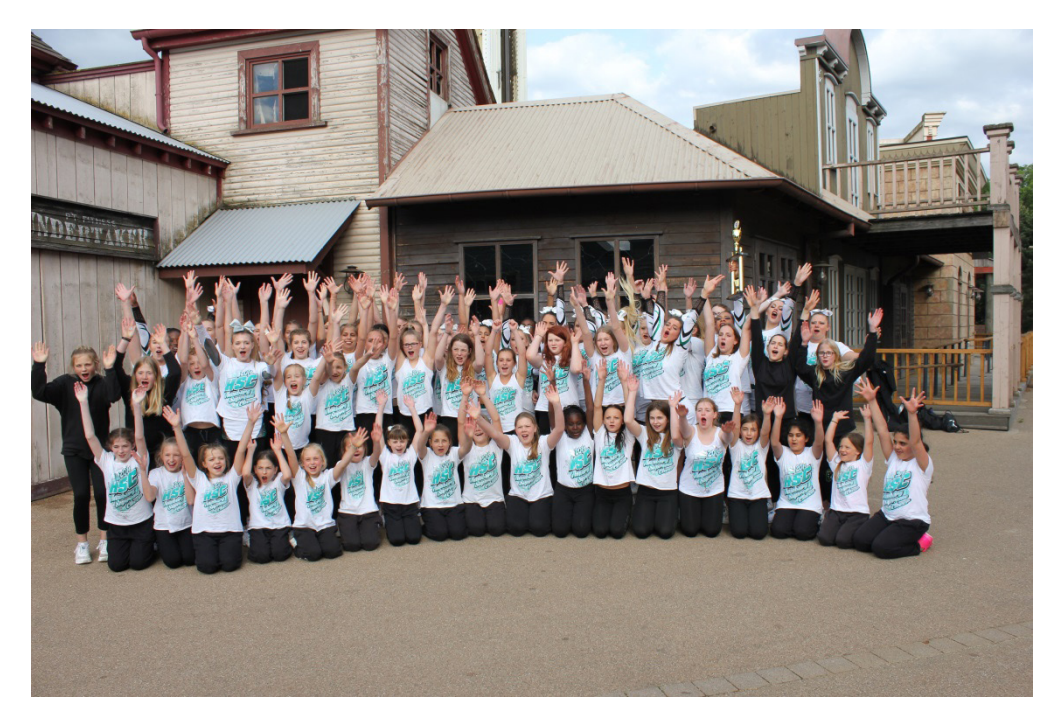
Figure 21. Trip of the cheerleaders of TSG Bergedorf to the German championships, organised by volunteers.

directions including refugees, the disabled, migrants, low income groups, youth and the elderly. For refugees, the club developed a brochure which explains 25 different existing sport offers in four different languages (German, English, Arabic and Farsi). The club attempts to provide its members with an extensive offer, including more than 100 sports, exercise and leisure-time activities such as health sports, rehabilitation, wellness, youth camps and travel, baby sports, swimming school, and fitness studios. Its slogan "Wir bewegen Bergedorf" ("we mobilise Bergedorf") represents one of the club's primary goals, namely offering the region a wide range of high-quality sports programmes. The extensiveness of the programme is demonstrated by the list of sports offered starting from 'A' like American football to 'Z' like Zumba. It organises and hosts many competitions, events and social gatherings, for instance the 'Kids Olympics' and an annual 5k and 10k run through the city of Bergedorf. The club engages in different school collaborations and runs four child care centres called "Sportini". The club's philosophy and corner pillars are fairness, solidarity, team spirit, and tolerance.