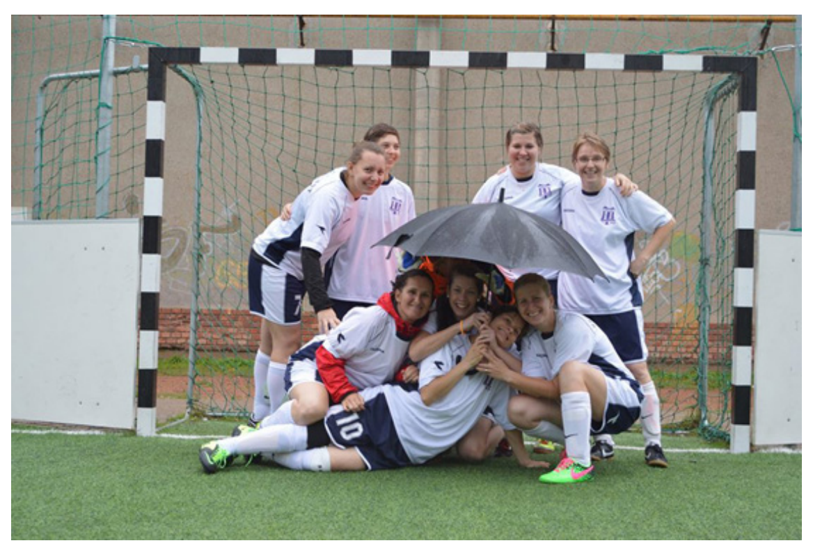
Figure 13. Silver medal at the women's Borbély Endre Memorial Football Tournament, 2014.

provides regular sports activities and organises competitions for deaf and hearing impaired people, is the Deaf Sports Club . The club offers a wide variety of activities organised in eleven sport sections, divided into gender and age groups. It plays a great role in social integration of disabled people, as the club is trying to reach out to people with disabilities thorough every possible forum. The functioning of the association is public, it rejects all discrimination based on gender, age, origin, race and any other discrimination. The club maintains contact with national and international organisations that are related. The club is also represented at international competitions and events with great success. Due to the club's contribution to strengthening social processes and cohesion between deaf and hearing-impaired people, they have managed to build a close relationship between people with and without disabilities, families and organisations.