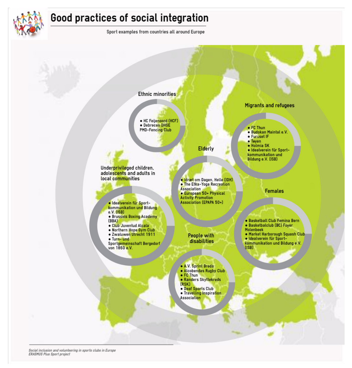
Figure 1. Sports clubs in Europe selected as good practice examples of social integration.

are also referred to by the EU (2010, 2011), emphasising the role and potential of sport and physical activity as a source of and a driver for active social integration .