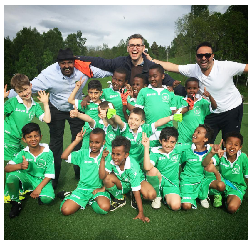
Figure 57. Football at Tøyen.

The club is also different from traditional sports clubs in not being afraid of, or concerned about, not being a traditional sports club. Asking for sporting achievement and possible future conflicts between those wanting to succeed in e.g. football and those contributing to the local community was not on the agenda. To be more explicit: sports are, if not marginal, then at least used pragmatically: the most important thing is to generate activity and solidarity.