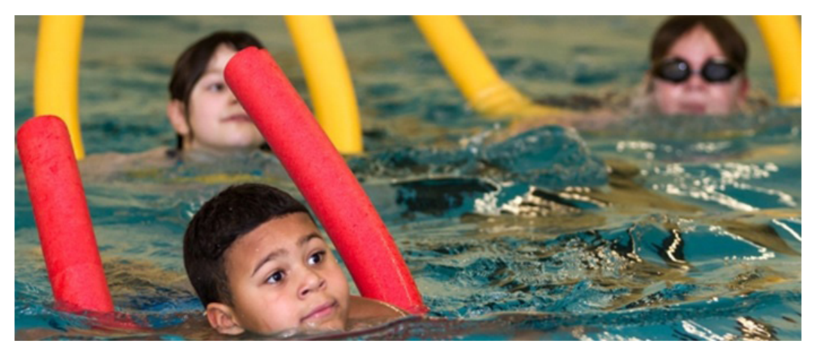
Figure 17. Children taking part in sports offers by the ISB.

This is visible through the activities of the Idealverein für Sportkommunikation und Bildung e.V. (ISB) . The ISB manages the project "Bewegte Ganztagsschule" ("moving all-day school"), an afternoon programme in all-day schools including all kinds of sport, education on different topics (i.e. nutrition), lunch, and homework supervision. The idea of the project is to support and foster social learning, thereby helping children to become confident individuals (also see section 3.1.1). Moreover, the club runs a project named "Vereint in Bewegung" ("united in movement"), which offers sport specifically tailored to women with a migration background (see section above). The club is able to react to changing social conditions by adapting the offers accordingly or using the change to create new sport programmes. The ISB wants to prevent social exclusion by making sport accessible to all groups, including children going to all-day schools, children from precarious family conditions, and older people. The most important factor in considering the ISB as a European good practice is that the ISB motivates other sports clubs to imitate its model and therefore provides consulting services through training sessions and communication of shared experience.