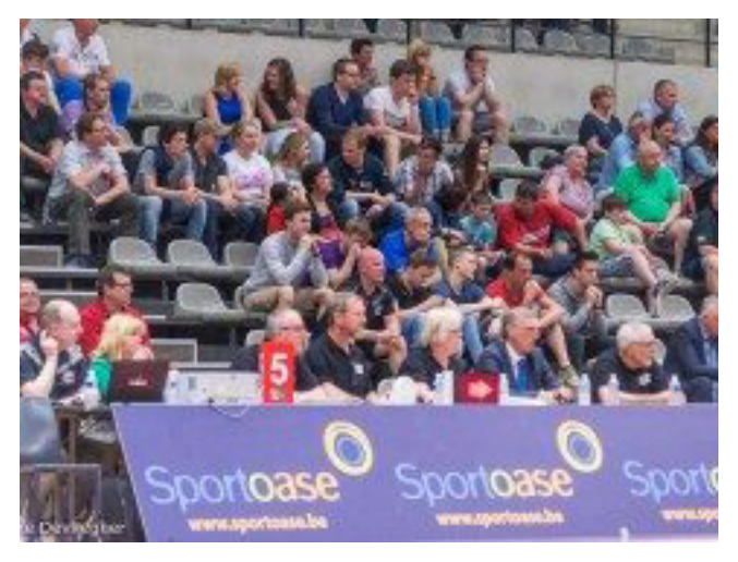
Figure 29. Game time, our 6th man. Leuven Bears, Belgium.

Leuven Bears is also a good example for making a distinction between different groups of volunteers. There are volunteers in the club who take on more general tasks: members of the Executive Committee, of the Board, or a specific Section. The club's Section Volunteers operates separately and there are three responsible persons who are responsible for consulting internally with the persons in charge of other sections regarding questions or issues concerning volunteers. Another group of volunteers are responsible for the organisation and management of the matches of the professional team, which requires a lot of volunteers, such as stewards and box office personnel. The largest group of volunteers is made up of the parents of the members of the thirty different teams of the club, who contribute their time by acting as time-keeping or score-keeping assistants during matches. The focus of the club in their cooperation with volunteers is on personal contact with them, taking into account their needs, opinion, experience and preference of engagement.