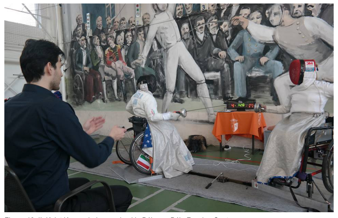
Figure 46. II. Kelet Kupa rehab organised in Békessy Béla Fencing Centre.

The goals of the fencing club are to promote fencing, maintain and offer fencers' friendly relationships and provide organised and structured national and international competitions to the different athletes. The club also seeks to maintain and enhance equal opportunities, and gives the chance for disabled children to promote their reintegration into society.