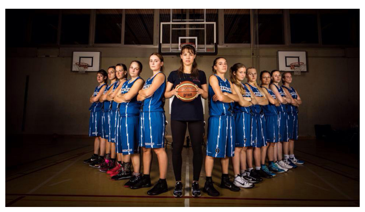
Figure 68. Team Femina 1.

There is a high level of agreement concerning "integration is a central societal task for sports clubs". The club agrees totally with the attitude of Swiss Olympic concerning the aim "integration of immigrants". The club respects culture-specific dress regulations.