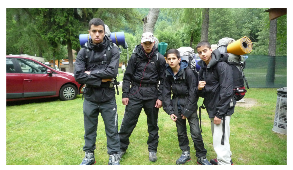
Figure 38. Monte Rosa 2012, To the Top.

The main good practice elements of the BBA are related to three pillars of the operation of the club, namely (1) how the BBA reaches a wide range of members; (2) how the BBA manages to retain its members who have a wide variety of backgrounds; and (3) how the BBA strives to educate and emancipate its youth members. These three pillars will be discussed in the next paragraphs, after which the most important strengths of the BBA are summarised.