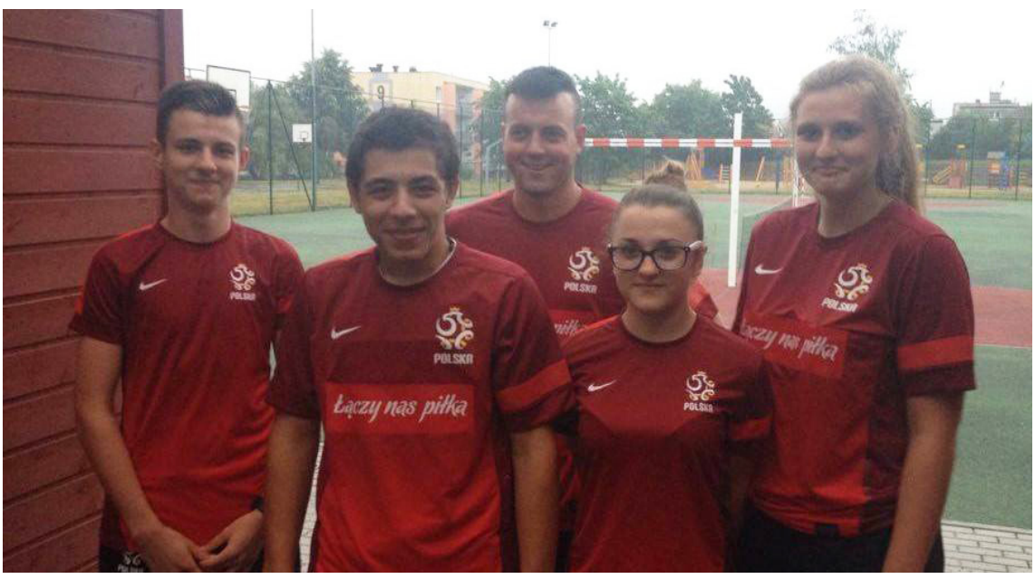
Figure 61. MSIS representatives during Streetfootballworld Festival 2016 (national initiative of Football for change).