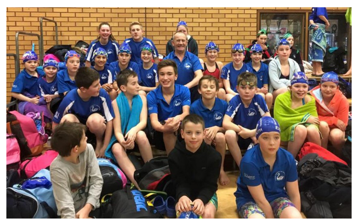
Figure 25. Exmouth Swimming and Lifesaving Society at the Dawlish Ribbon gala 2017.