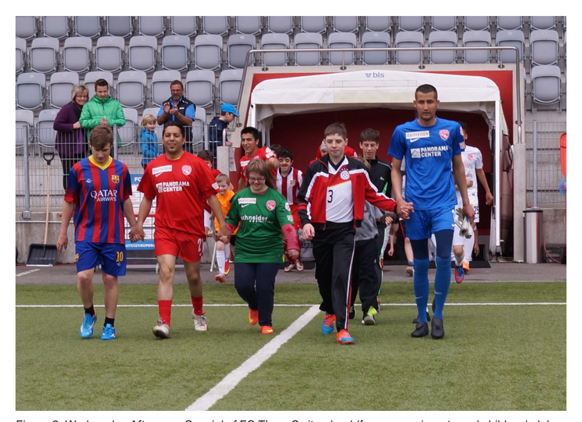
Figure 2. Wednesday Afternoon Special of FC Thun, Switzerland (for young migrants and children/adolescents with disabilities).

portant showpiece of FC Thun , a professional premier league football club in Switzerland. Since the season 2007/2008, FC Thun has incorporated the programme "FC Thun macht Schule" ("FC Thun performs training"), dedicated to young refugees living in refugee hostels, into its programme to train their players in a broad sense, through promoting personality development and the acquisition of social competences. Since the 2011/2012 season, the professional team has also been integrated into the project and has an important exemplary function. The "Wednesday Afternoon Special Training sessions" are organised free of charge in the Stockhorn Arena in Thun (the stadium of the professional team), and in particular it is open to beginners without imposing a limit on the number of participants. The young players of FC Thun learn to deal with diversity through experiences in a diverse social context. The asylum seekers can improve their skills with the German language and broaden their knowledge about the culture and common social manners. Consequently, the actions of FC Thun in the area of social integration can also be seen as corporate social responsibility, as there is no benefit from the athletic point of view or in terms of talent-spotting.