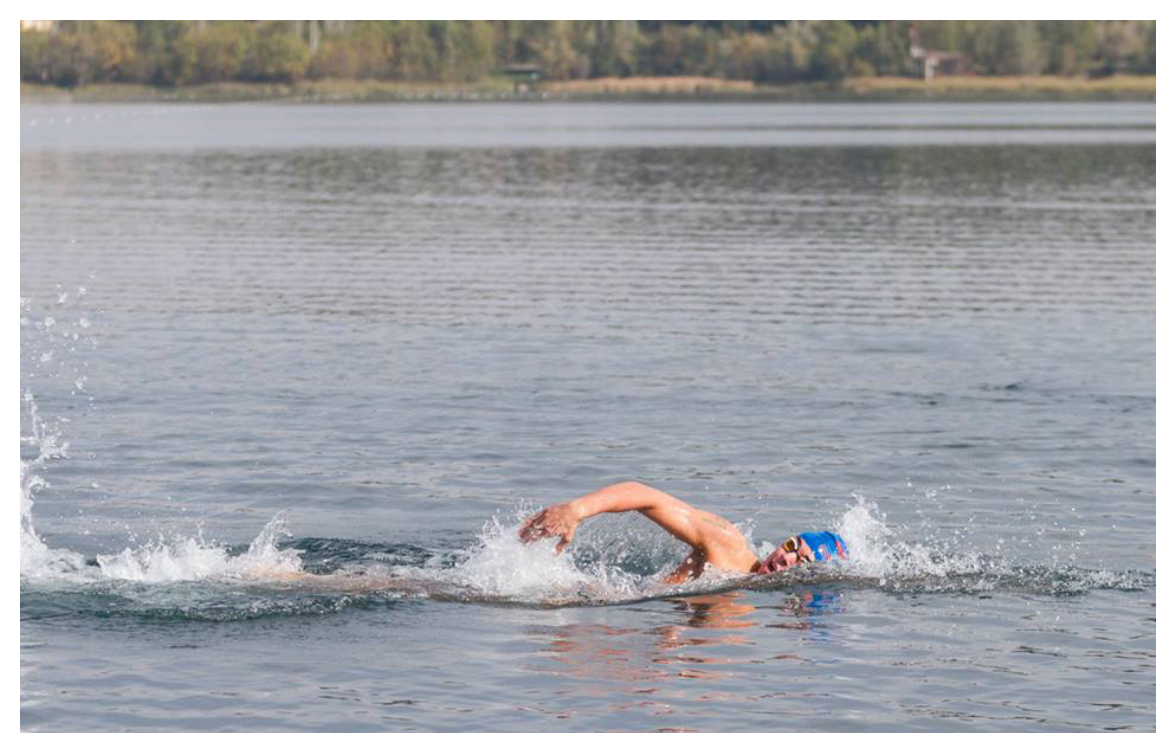
Figure 63. Swimmer in Lake Banyoles.

The volunteer management model is based on mobilising all those people who are and who have been members of the club. It is an intergenerational mobilisation scheme. Thus, for example, for the two most important and oldest sport events organised by the club, they can call on people who practised sports in the club 30 years ago or more. A call for help is sent out to everybody who is or has been linked to the club.