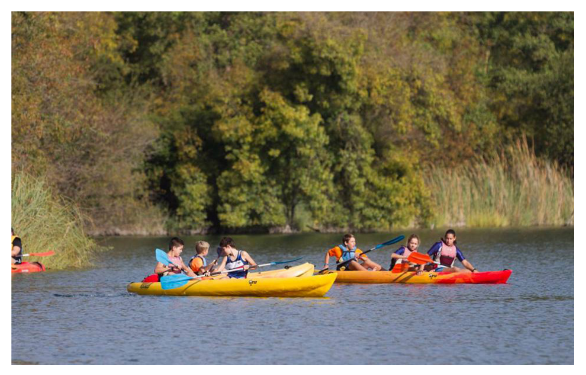
Figure 62. Children on Lake Banyoles.