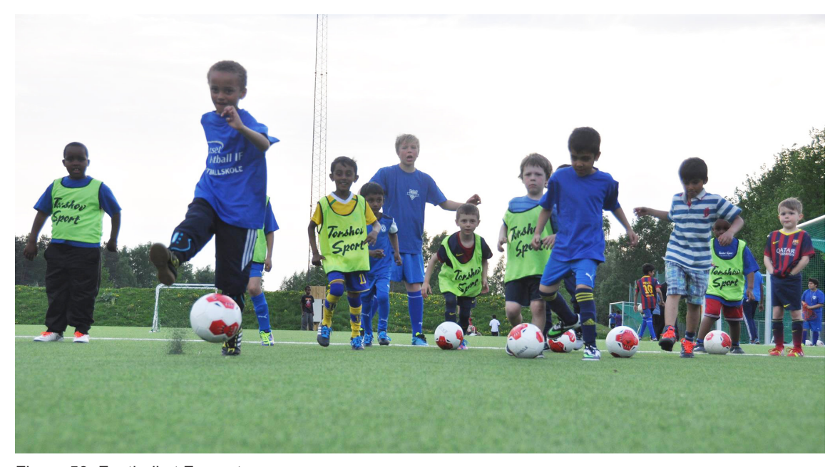
Figure 53. Football at Furuset.

In Furuset, Allidrett covers many types of activities: football, capoeira, track and field, basket, a-ball, handball, playing at ice, dance, horse riding, light-walk along the river, film/movie, Christmas march/party, "Stjerner i sikte" (Idol-like competition), summer camp, orienteering (stolpe-jakten). In 2015, 601 children participated, of which 270 were girls, 64% with a minority background. One Tuesday every month, there is a meeting where children, youth and leaders discuss the activities – should there be something more or different? – and whether there are groups of children that should be invited to Allidrett.