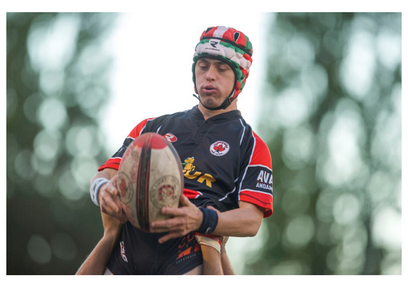
Figure 66. A member of the club playing rugby.

The club has three sections. The first is for rugby competition, where people over 18 years old are integrated. The second is the Rugby Academy for players from 14 to 18 years old. The third is the Rugby School for boys under 14 years old. All the club's teams are currently male.