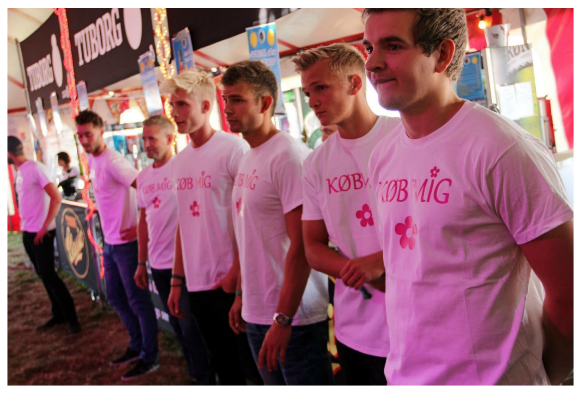
Figure 26. Members of the "club for volunteers" at Skjold Skævinge Sport Club.

In order to keep volunteers engaged, the Skjold Skævinge Sports Club in Denmark attaches great importance to recognition. They focus particularly on visibility by letting people in the club know what has been accomplished through the efforts of volunteers from the "club for volunteers", so that other members can recognise the volunteers for their work.