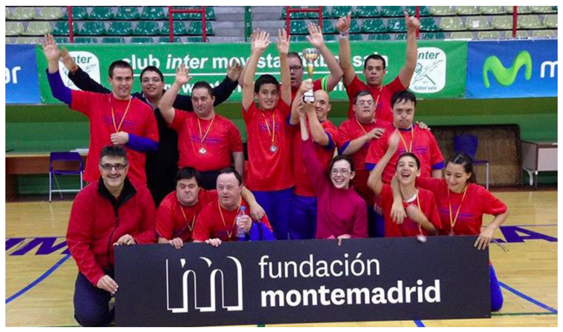
Figure 19. Members of the team after winning a medal.

the activity itself. The coaches coordinate with the school, so that if a child misses a class or does not behave appropriately, he/she is not allowed to participate in the "basketball for everyone" programme. The school guidance teams point out that the activity is very beneficial for the children because it improves their integration, respect towards others, and achievements at school. Regarding the functional diversity of activities, in many cases, this is the only opportunity that these children have to practise sport. It is an activity that benefits them in terms of integration, health and social relationships.