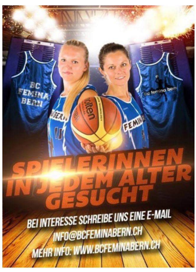
Figure 15. "Girls, we want you!" by Basketball Club Femina Bern.

amples. This club could also be positioned in the migrants subchapter as it promotes social integration of young female immigrants through integration-oriented actions. Because of the flow of refugees since 2015, the club started an integration project, directly aimed at female asylum seeking girls and young women. Training sessions at competitive and grass roots level take place within a supportive social environment characterised by female coaches and women teams. Additional basketball training sessions (free of charge) are offered as part of voluntary sports at schools. Common tournaments (on local/ national level) are regularly organised with teams in the region of Bern. The integrative project is also supported by female players of BC Femina who either conduct regular basketball training sessions in the club or municipal and national sport events for children and adolescents. Up to now, the club has been successful in terms of not having had any serious problems and discrimination with regard to cultural diversity, and there is a high amount of socially integrated members and no remarkable exits out of the club.