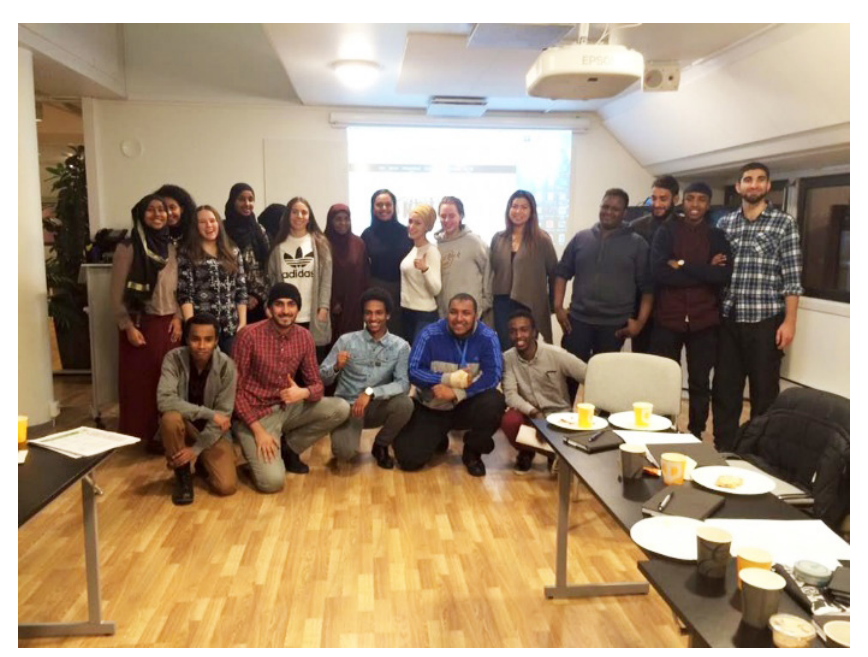
Figure 56. Meeting at Tøyen.

in such (voluntary) work. (3) To make the participants into visible and positive role models in the local community. (4) To make the participants conscious of how discrimination and prejudices come to the fore and to learn methods to focus upon this. (5) The academy should teach the participants to take responsibility for the local community. (6) Participants in the academy are expected to contribute as teachers in "next year's" academy.