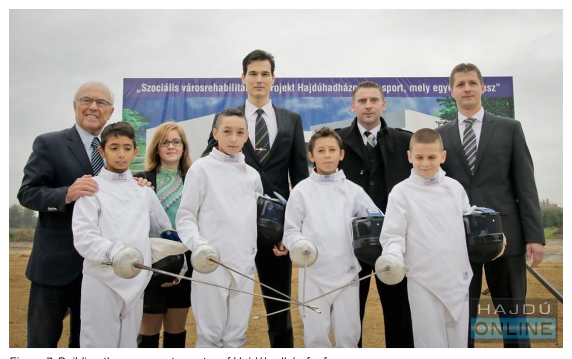
Figure 7. Building the new sports centre of Hajdúhadház for fencers.

Besides having several assets, the practice of the club is threefold. Firstly, the club is integrating Roma children into the sport of fencing that is outside the mainstream sports that are generally offered to this group. Secondly, on a nearby settlement with high rates of Roma children, the club assisted in the foundation of a new sports club, Hajdúvitézi Cultural and Sports Club, which started its operation independently offering fencing for Roma children. DHSE provides continued assistance in coaching and competition opportunities, as well as assistance in sport-related and management-related issues. Thirdly, DHSE also assisted in the building of a special fencing facility for its new companion club with the collaboration of the city council of Hajdúhatház. In September 2015, the new fencing room was opened as part of the new sports centre of Hajdúhadház. Through the assistance of a club with long traditions and experience in a specific sport, a new local sporting unit was established. The intervention of DHSE fulfilled the personnel, facility and management needs that were necessary to provide opportunities in the sport of fencing for involving and integrating local Roma children and youth.